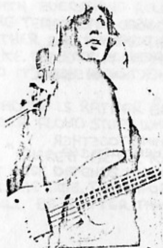
(TALKING ABOUT SYD) Floyd singer ROGER WATERS

(Laughs). This is a track I didn't produce because it didn't need anything doing to it. This song makes everything else you have played me look completely sick and silly. I think this is very beautiful. Don't take it off, I'm going to listen to it all the way through. I think that is a great song. In fact all the songs on this album are great. No, some of them on it are great—in capital letters—and all of them are good. Syd is a genius.